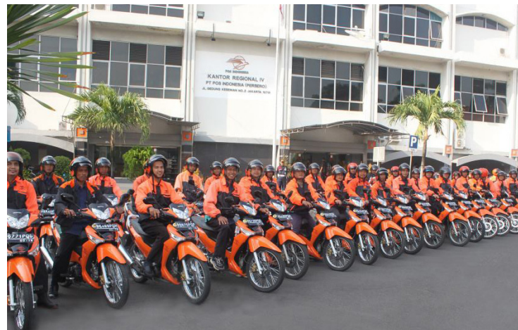
Above: PT POS employs over 70,000 staff.

Kinesis is set to replicate the meaningful economic impact of this nationwide financial provision across other financially underserved economies of Southeast Asia; targeting our important efforts next at the unbanked populations of Sub-Saharan Africa and Latin-America.